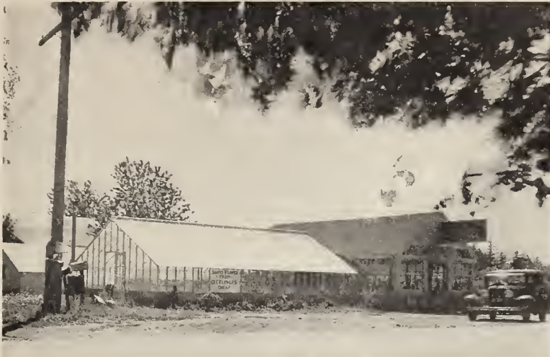
Our new Display Room and one of the Greenhouses